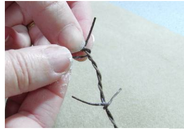
Repeat with the second length of cord wrapping it around the other end of the twisted cord.