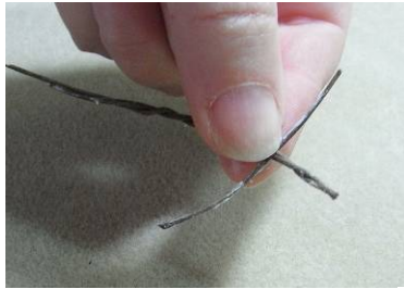
Wrap it once around one end of the twisted cord.....