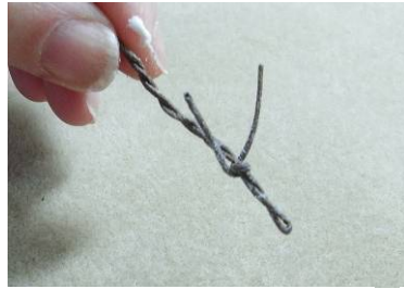
so that it creates a barb.