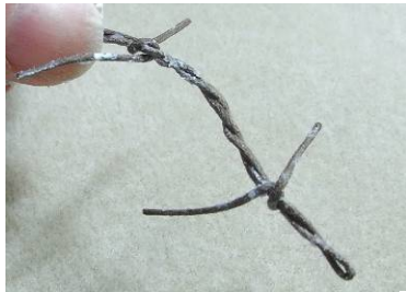
Allow the adhesive to dry clear