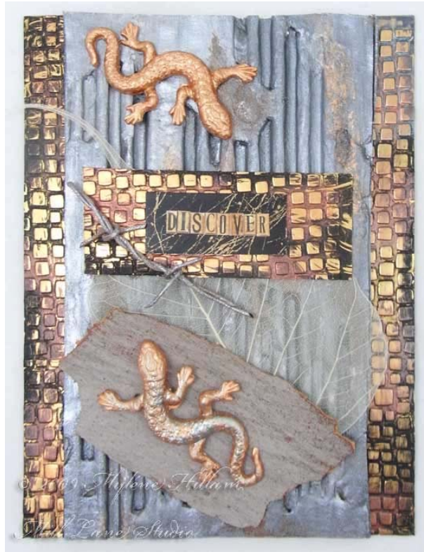
And here's a finished sample – a rustic card featuring bronze lizards, corrugated iron, an earthy cobbled background and faux barbed wire.