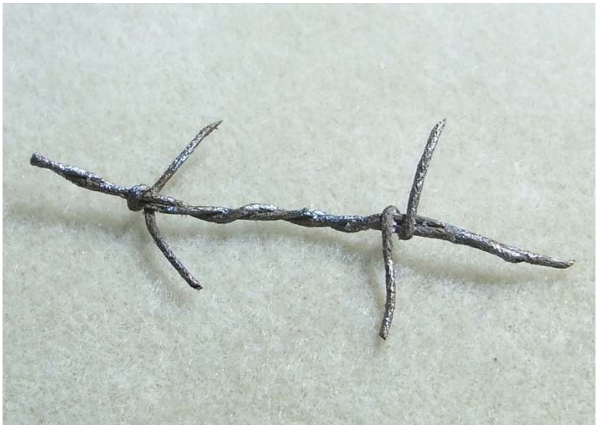
Faux barbed wire – ultra light, no sharp points and absolutely no rust to transfer to your project.