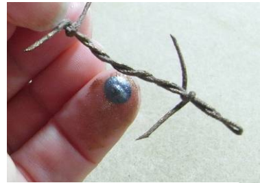
Use your finger to randomly paint on Lumiere paint to create the rusty, weathered look associated with barbed wire.