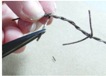
Trim all cut ends at a sharp angle so that the barbs look sharp.